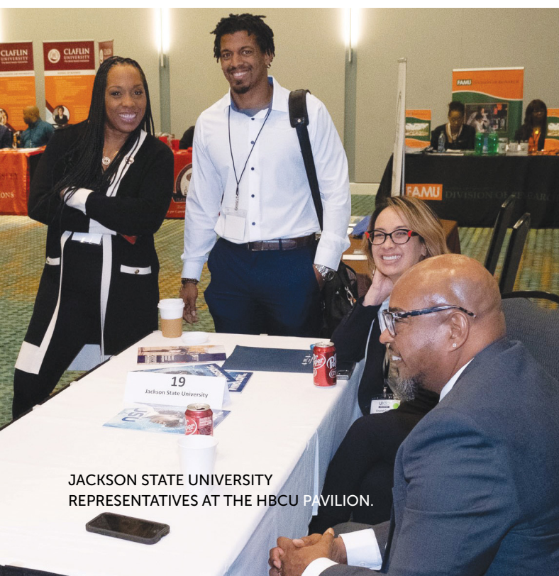
JACKSON STATE UNIVERSITY REPRESENTATIVES AT THE HBCU PAVILION.

Dow's SURE program serves to build equity in the talent pipeline. Dow's program gives on-campus undergraduate research experience with a Dow mentor.