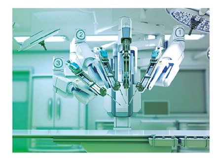
High-tech equipment (shared by universities)